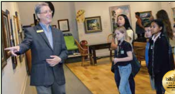
Named Best Museum 2018